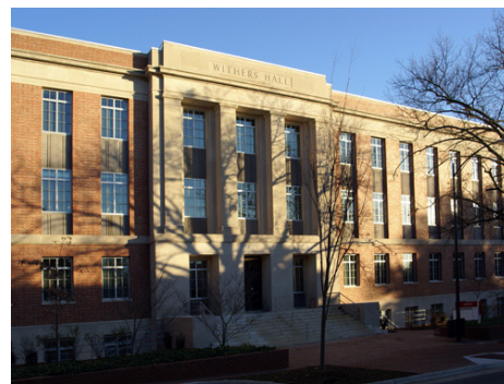
In December 2006, the Department of Philosophy and Religion moved into newly-renovated Withers Hall.

Over the past few years, the Glaxo-SmithKline Semantic Technologies Group has supported the Logic and Cognitive Science Initiative with grants to the value of $122,000. These have funded undergraduate internships in knowledge exploration and two public lecture series.